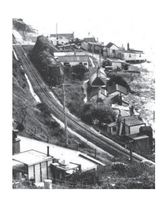
Hobson Street