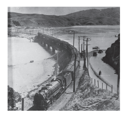
Paremata rail bridge

Four triangular concrete tank traps – now on display at Dolly Varden Reserve – were to be positioned on the Paremata bridge to act as road blocks for any invading forces.